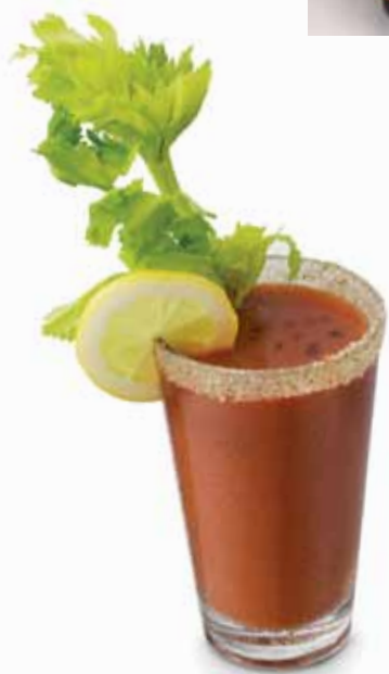
MAGGI BLOODY MARY