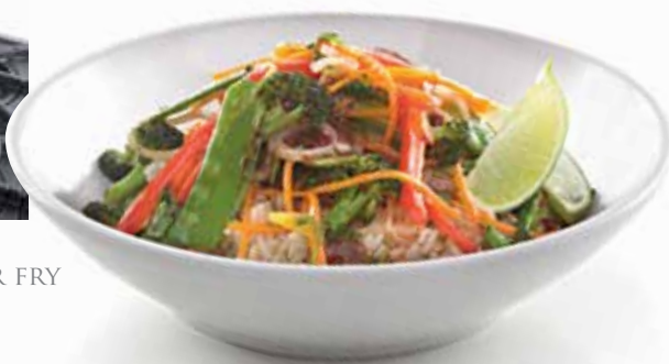
MAGGI STIR FRY