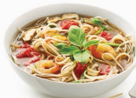
BEEF AND SHRIMP PHO (GLUTEN FREE)*

Made with MINOR'S Natural Gluten Free Beef Base.