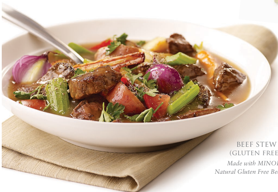
BEEF STEW (GLUTEN FREE)*

Made with MINOR'S Natural Gluten Free Beef Base.