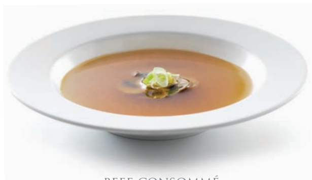
BEEF CONSOMMÉ (GLUTEN FREE)*

Made with MINOR'S Natural Gluten Free Beef Base.