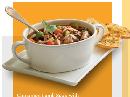
Cinnamon Lamb Soup with MINOR'S® Natural Gluten Free Beef Base

Nestlé Professional soup bases and sauces are the foundation of popular savory soups and noodle bowls that invite students to create their own flavor experience. Simply prep the broth and feature complementary ingredients in your action station for customizable combinations they won't forget.